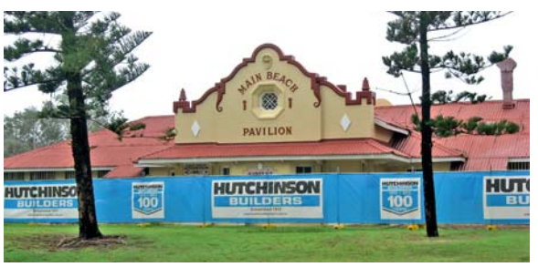
Hutchies at work on the landmark pavilion.

When first opened, the two facilities offered an unprecedented level of comfort and privacy for the bathing public.