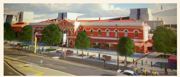
QR's heritage-listed South Brisbane railway station.

The team is now heavily involved in pricing more QR projects.