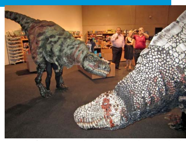
A couple of dinosaurs mingled with guests at the Queensland Museum's birthday party.

The South Bank site is Queensland Museum's flagship in the group of six campuses across the state and, as one of Queensland's oldest and most historic organisations, it welcomes 560,000 visitors a year.