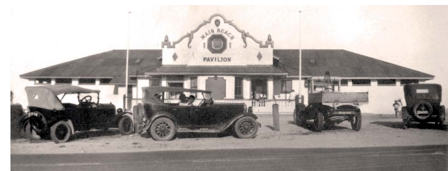
The iconic Main Beach Bathing Pavilion pictured in February 1935 proved popular with beach goers.