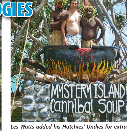
flavour when he was selected to become Cannibal Soup on Mystery Island, Vanuatu.