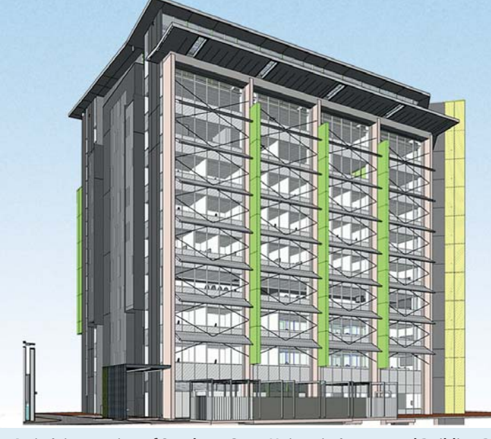
Artist's impression of Southern Cross University's proposed Building B.

Village Shopping Centre - food precinct. The design and construction elements incorporate concrete tilt-up panels; structural steel metal and FC/CFC cladding; glazing walls and metal roof construction.