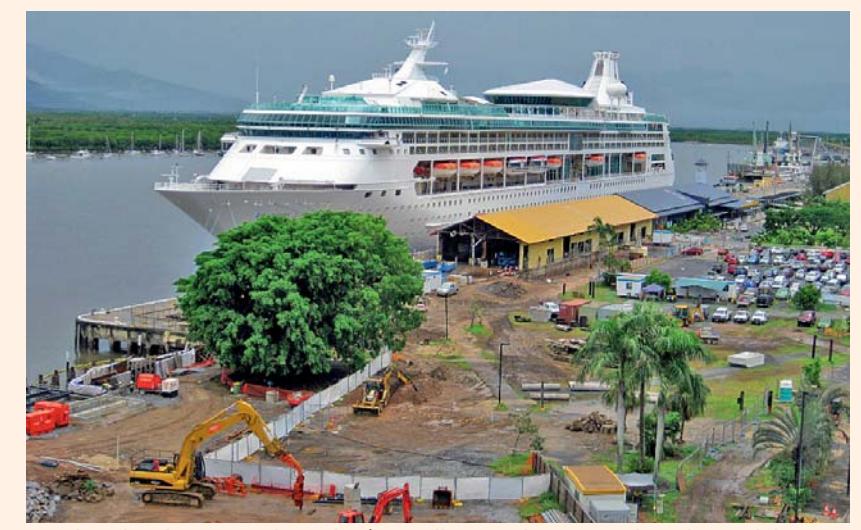
Hutchies has begun work on the $23 million works to complete the 1.6 kilometre public waterfront promenade linking the Esplanade through to the new Cairns Cruise Liner Terminal.

will see the heritage-listed "Wharf Shed No. 2" transformed into an impressive commercial waterfront facility with links to an interactive