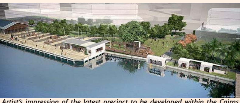
Artist's impression of the latest precinct to be developed within the Cairns Foreshore Redevelopment.

"When completed, it will transform the Cairns waterfront and provide Cairns with a major new entertainment, tourism and leisure precinct to rival major city waterfront spaces."