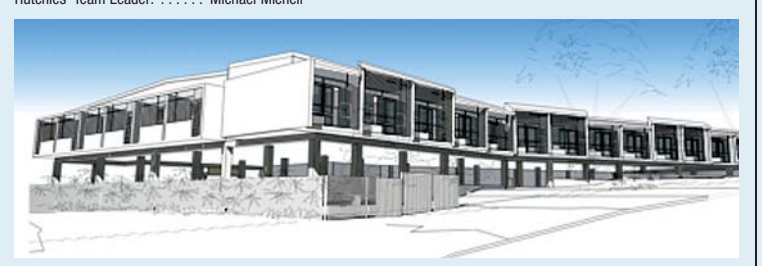
Artist's impression of the new Mental Health Unit at the Sunshine Coast Private Hospital.