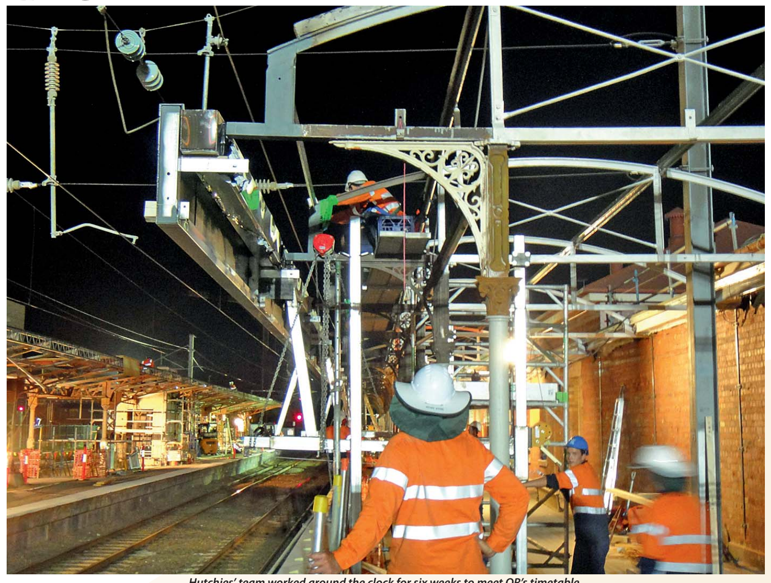
Hutchies' team worked around the clock for six weeks to meet QR's timetable.